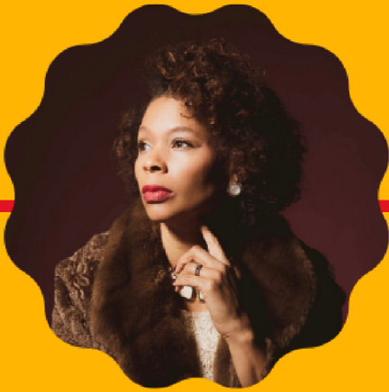
FEATURING SINGER/SONGWRITER TERRA TROFORT