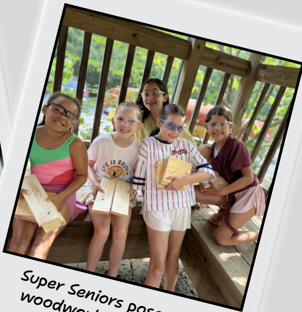
Super Seniors pose with woodworking projects.