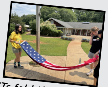
CITs fold the flag at the end of the day.