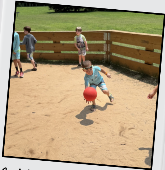
An intense game of Gaga Ball went down for the Juniors.