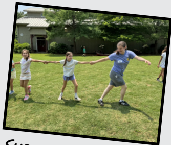
Super Seniors play on the Meadow.