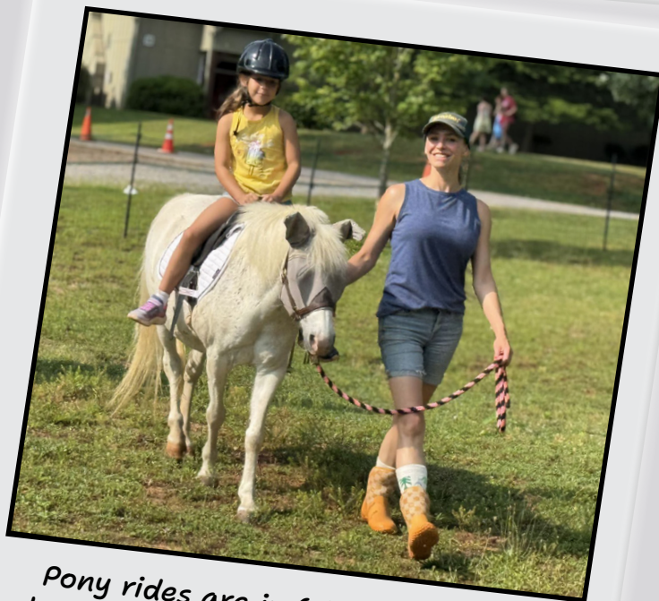
Pony rides are in full swing and have brought out bravery and joy in the campers!