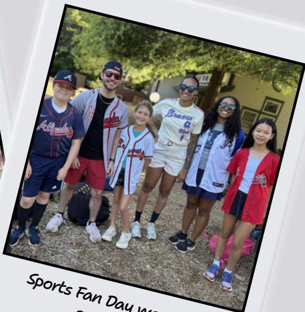
Sports Fan Day was a hit on Friday!