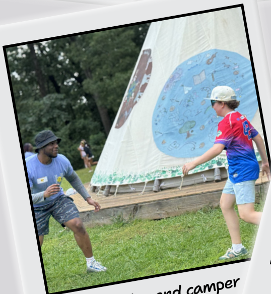
A Senior Legend camper plays a game with his counselor.