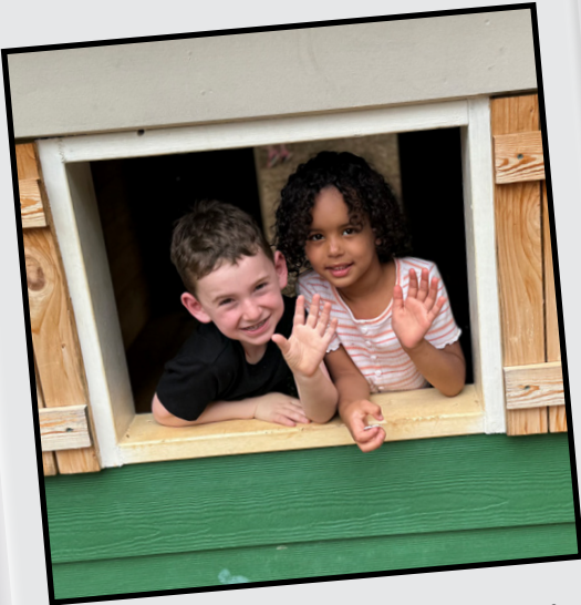
Grasshoppers enjoy time on the playground!