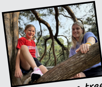
There's always a tree to climb at camp!