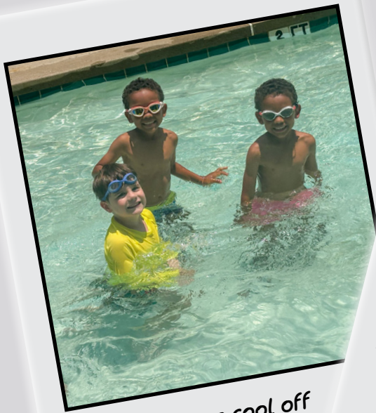
Campers cool off in the pool.