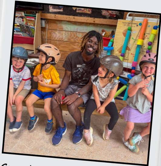
Grasshoppers hang with their counselor before pony rides.