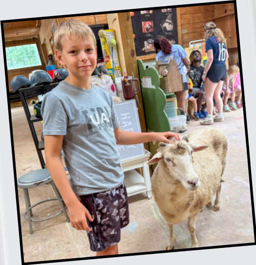
Willow the sheep loves pets from campers!