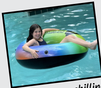
Hot days mean chilling in the pool!