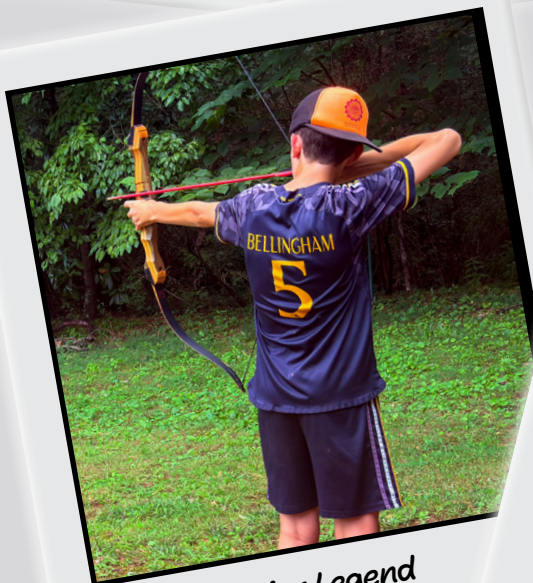
A Senior Legend works on his archery skills.