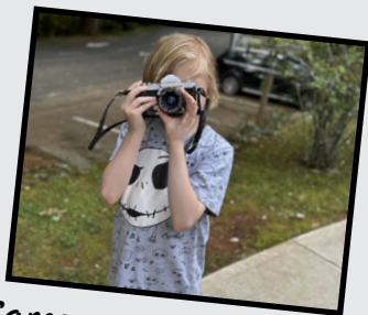
Campers are learning about photography.