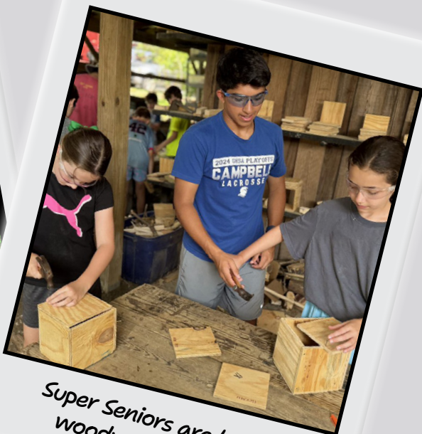
Super Seniors are loving woodworking class.