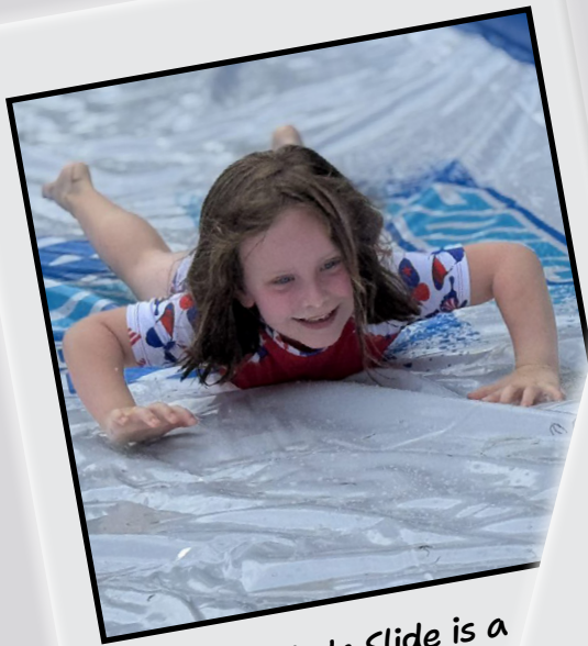
The Slip 'n Slide is a hit with campers!