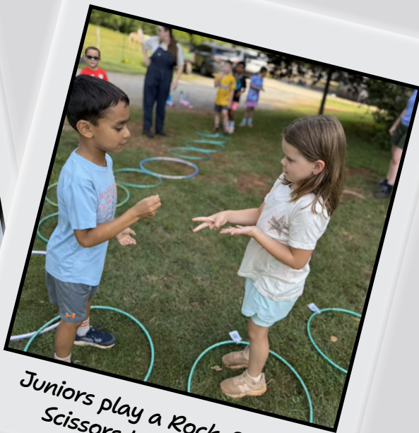
Juniors play a Rock, Paper, Scissors tournament.