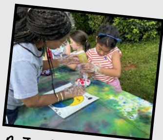
A Junior works on tie-dye.