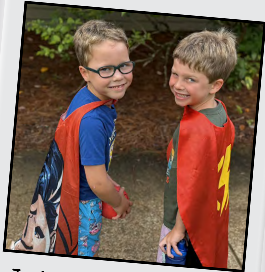
Juniors pose on Unit Choice Superhero Day!