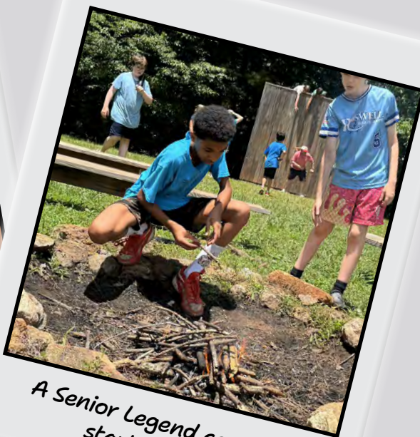
A Senior Legend camper starts a fire.