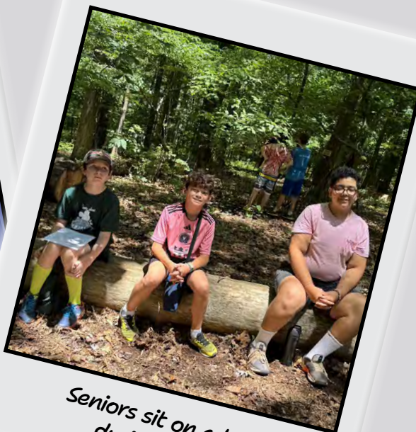
Seniors sit on a log during Lore.