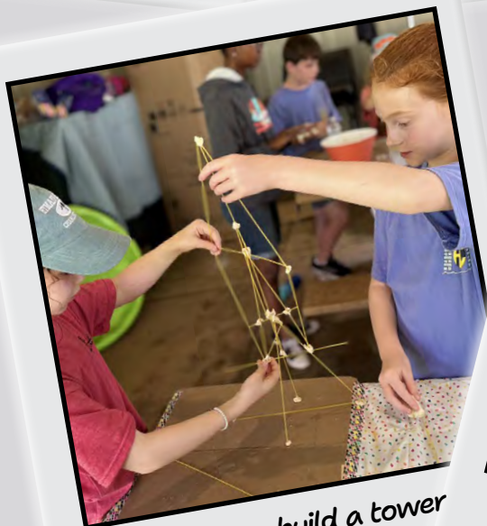
Super Seniors build a tower of pasta and play dough in Discovery.