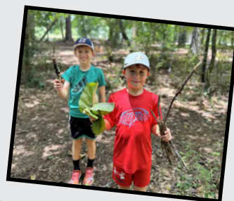
Super Seniors explore in the woods.