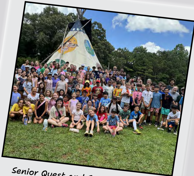
Senior Quest and Senior Legend campers pose at the Tipi.