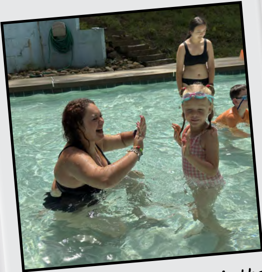
Grasshoppers enjoy time in the pool. High five!