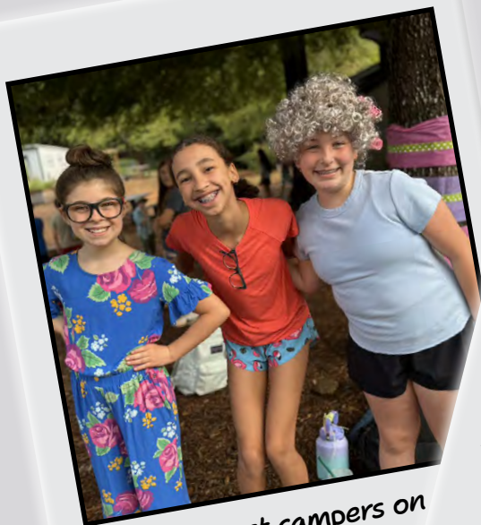
Senior Quest campers on "Me in 50 Years" Day.