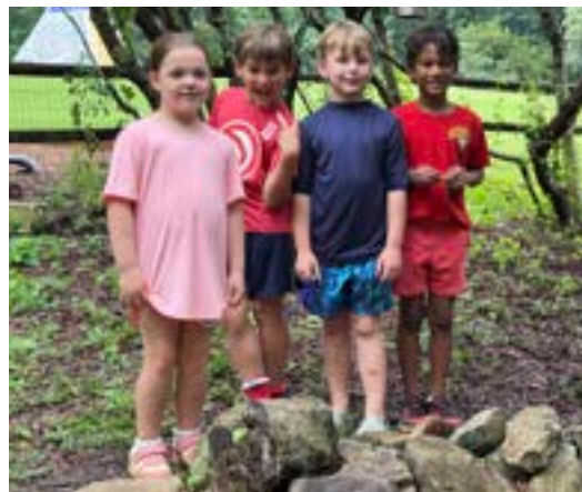
Campers in Seniors (top) and Juniors (bottom) enjoying the Water Garden!