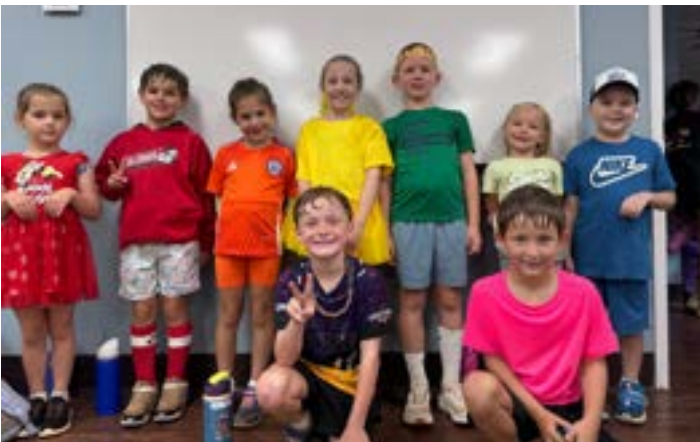
Juniors campers made a rainbow for Rainbow Day!