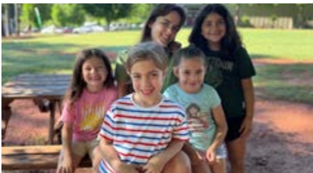
Juniors campers pose for a picture with their counselor.