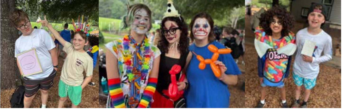
Campers in both Senior Quest and Senior Legend showed off their artistic side for Art Day!