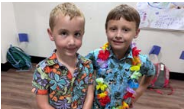
Grasshoppers dressed up for Tropical Day!