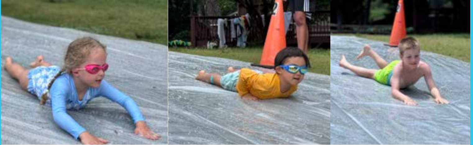
Campers in Grasshoppers (left and center), and Super Seniors (right) slid down the water slide on Wednesday!