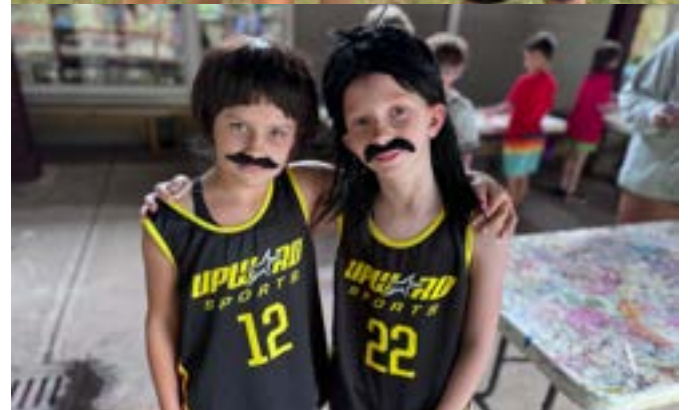
Campers in Super Seniors paired up for Twin Day!