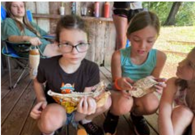
Super Seniors campers learning about animals in Nature class!