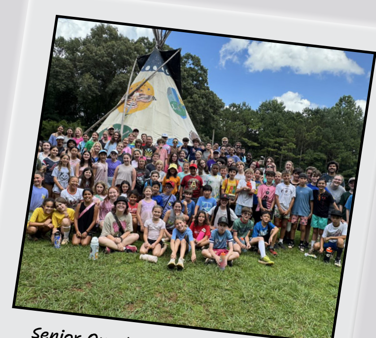
Senior Quest and Senior Legend campers pose at the Tipi.