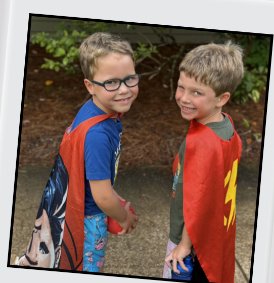
Juniors pose on Unit Choice Superhero Day!