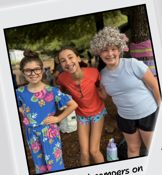
Senior Quest campers on "Me in 50 Years" Day.