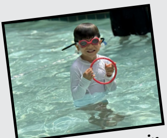
Collecting rings in the pool!