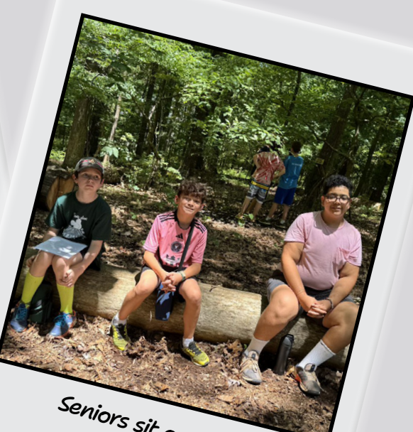
Seniors sit on a log during lore.