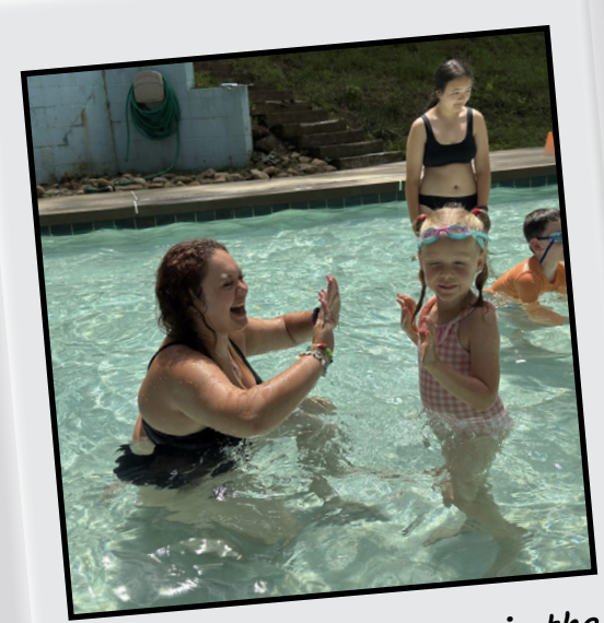
Grasshoppers enjoy time in the pool. High five!