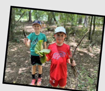
Super Seniors explore in the woods.