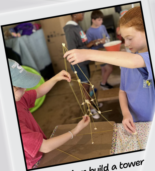
Super Seniors build a tower of pasta and play doh in Discovery.