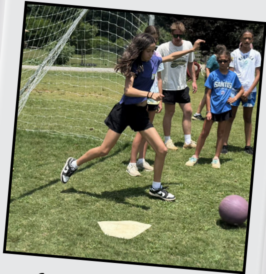
Games of kickball are always intense!