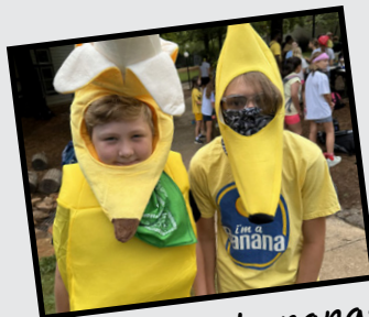
Time to go bananas!