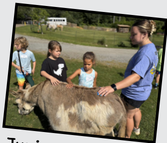
Juniors pet Roger.