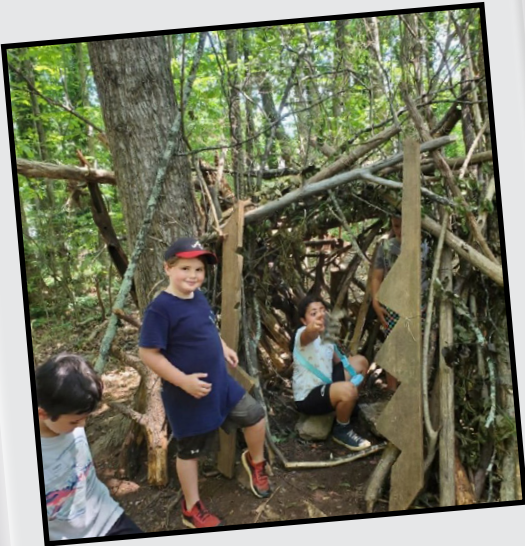
Super Seniors enjoy building a fort .