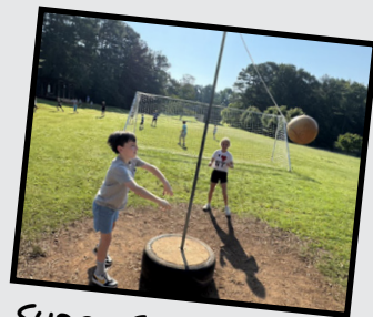
Super Seniors play Tetherball!