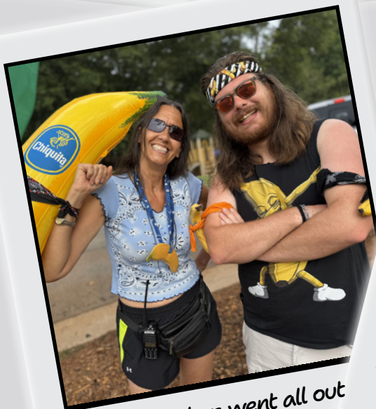
Our counselors went all out for banana/bandana theme day!