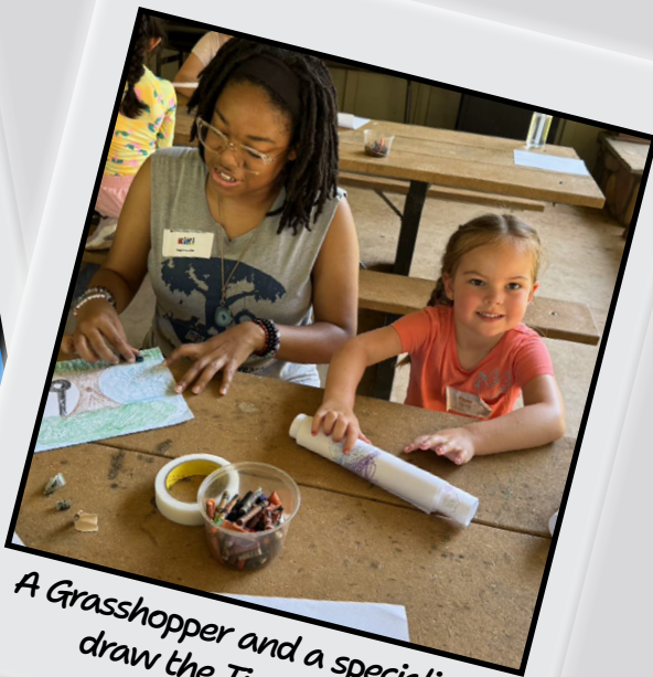
A Grasshopper and a specialist draw the Tire Swing.