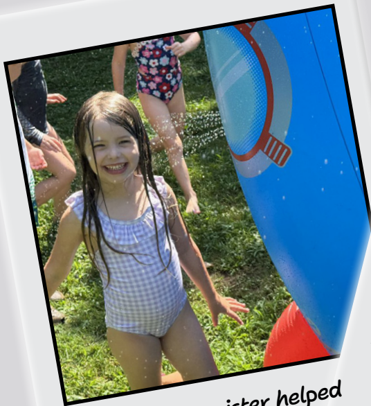
The water mister helped Grasshoppers cool off!