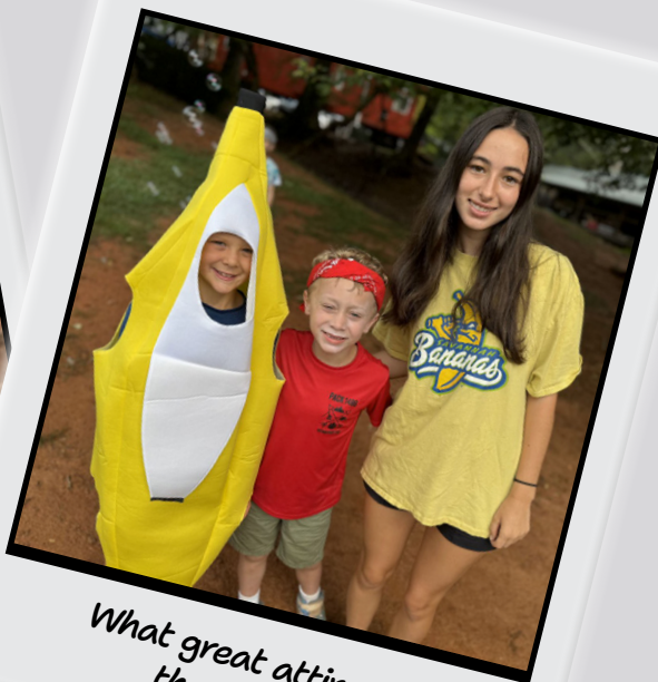
What great attire for theme day!