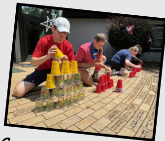
Cup stacking games are intense!