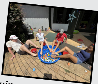
Playing games during the Hot Dog Cookout!