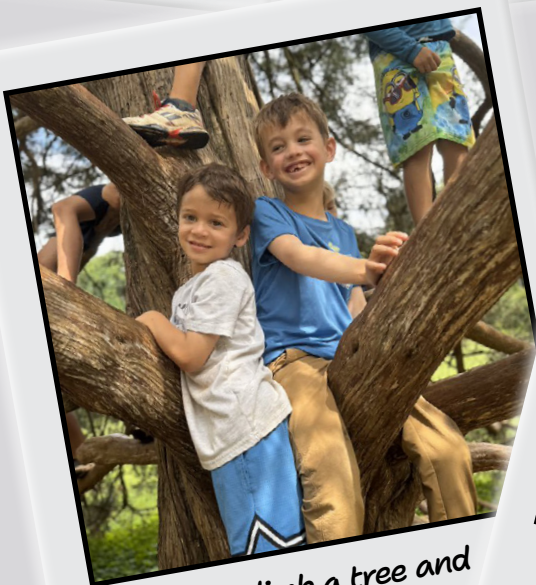
Juniors climb a tree and share a laugh!