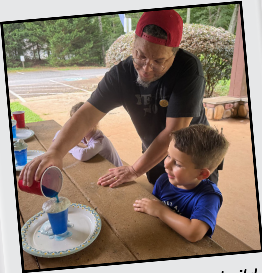
Rey and a Grasshopper build a volcano!