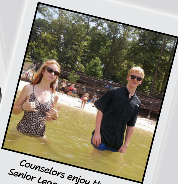
Counselors enjoy the Senior Legend Lake Day!