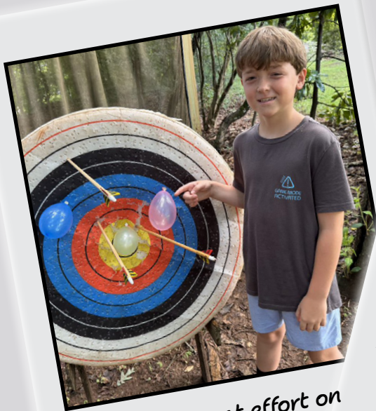
What a great effort on the archery range!