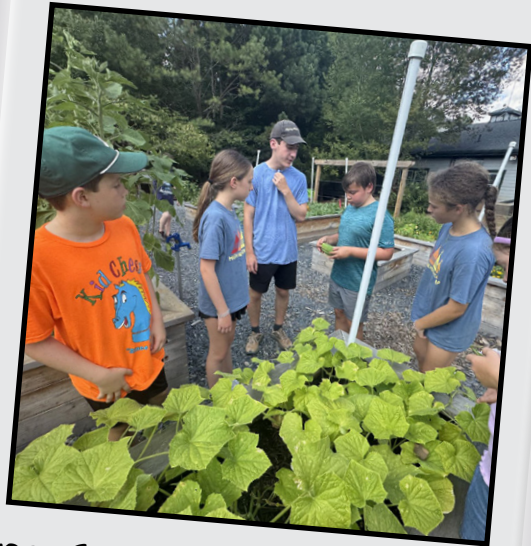
Super Seniors work on the garden by the Upper Meadow.