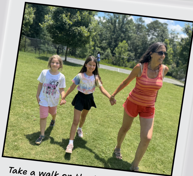
Take a walk on the Meadow with me! Could that be a song title?!