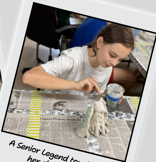
A Senior Legend touches up her clay animal.