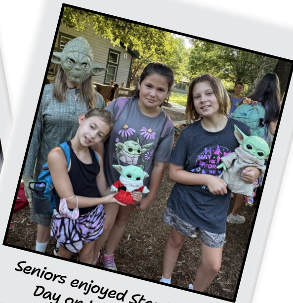
Seniors enjoyed Star Wars Day on Wednesday!