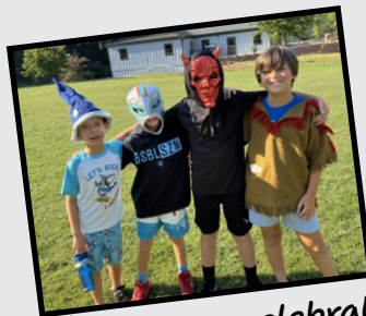
Super Seniors celebrated Halloween for Unit Choice!