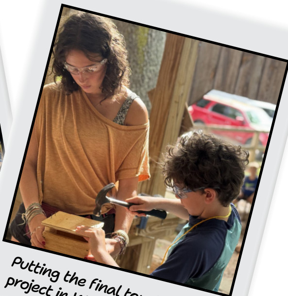
Putting the final touches on a project in Woodworking class.