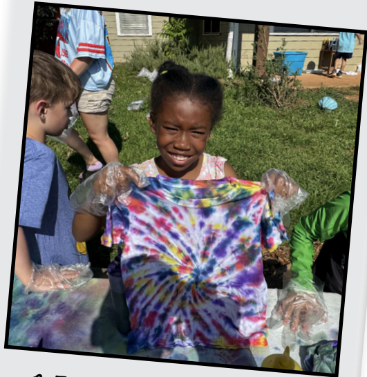
A Junior tie dyes a shirt!