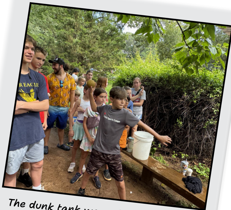
The dunk tank was a hit on Water Carnival Day!