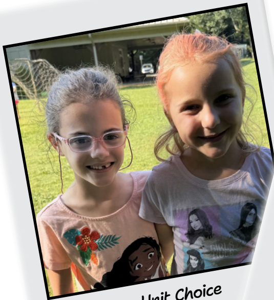
Juniors Unit Choice was Disney Day!