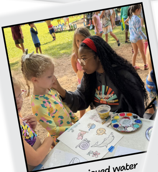
Campers enjoyed water color face paint on Water Carnival Day!