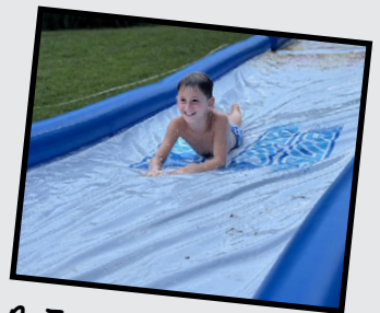
A Junior enjoys the water slide!