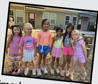
Grasshoppers wore their favorite color for Unit Choice!