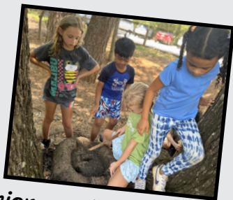
Juniors explore the woods during group time!