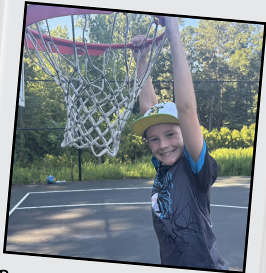
Do we have a future NBA Slam Dunk Contest champ at camp?!