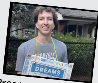
Dream on! Friday was Alphabet Soup Day!