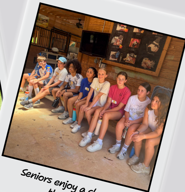
Seniors enjoy a class in the barn.