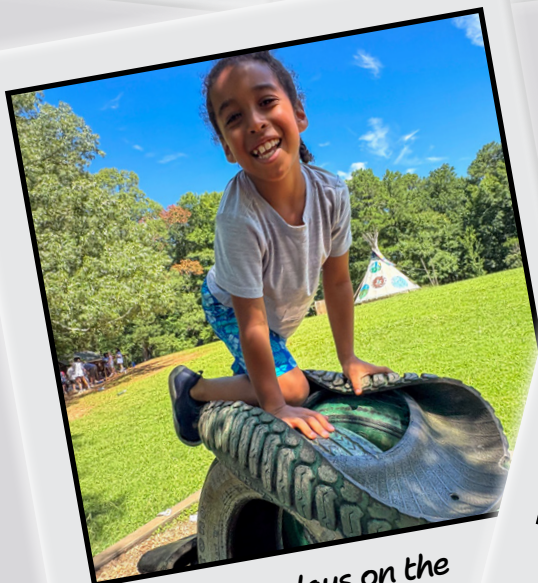
A Junior plays on the Tire Dragon.