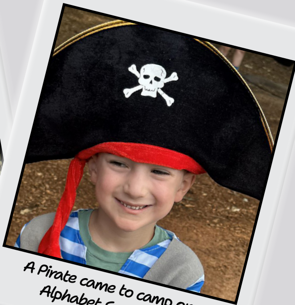
A Pirate came to camp on Alphabet Soup Day!