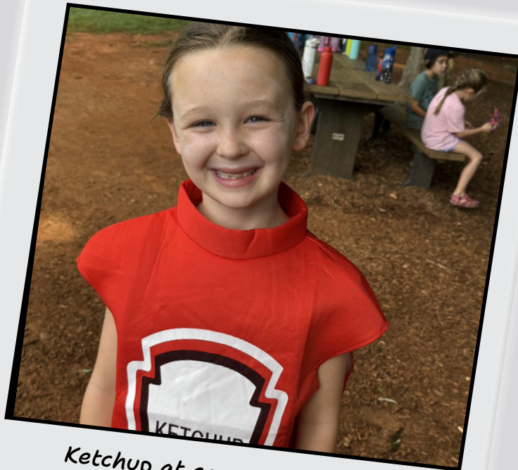
Ketchup at camp?! Only on Alphabet Soup Day!