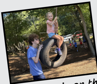
Taking a spin on the Tire Swing!