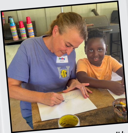
A Junior enjoys Discovery with a specialist.