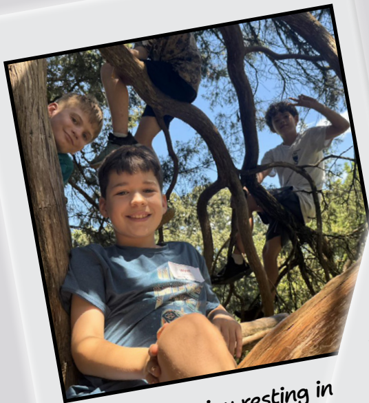
Seniors enjoy resting in a tree.