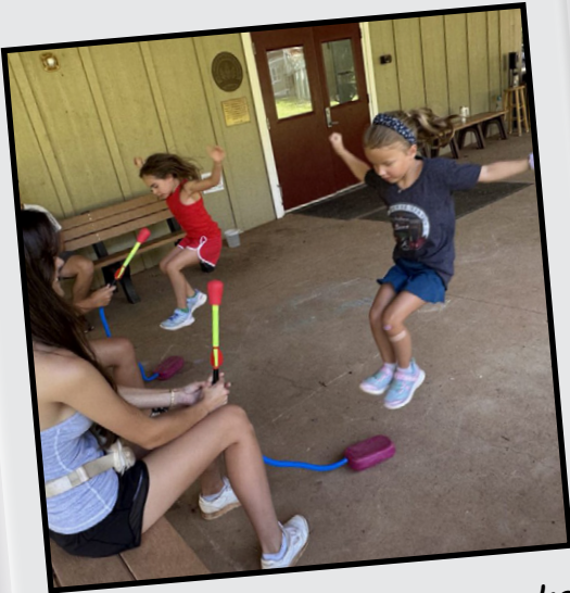
Juniors compete in stomp rocket relay races.