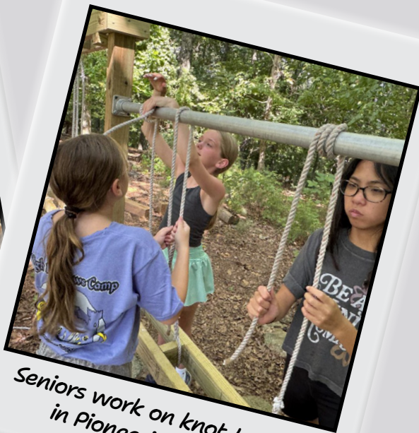
Seniors work on knot-tying in Pioneering class