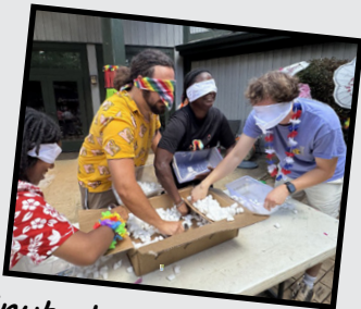
Minute to Win It games on Friday!