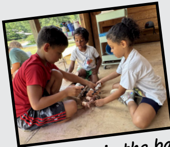
Juniors play in the barn.