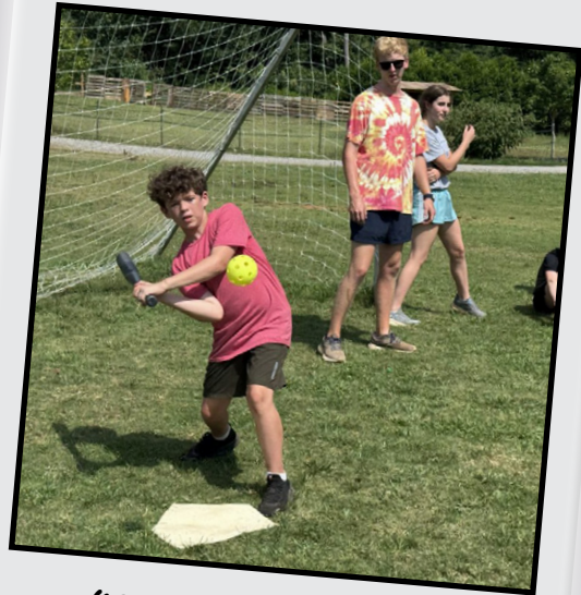
"Swing and a drive!" Wiffle ball games were a highlight!