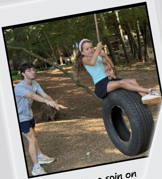
Enjoying a spin on the Tire Swing!