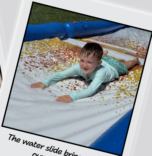
The water slide brings joy to our campers!