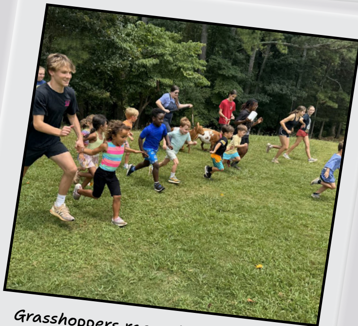
Grasshoppers race with the goats on the Lower Meadow!