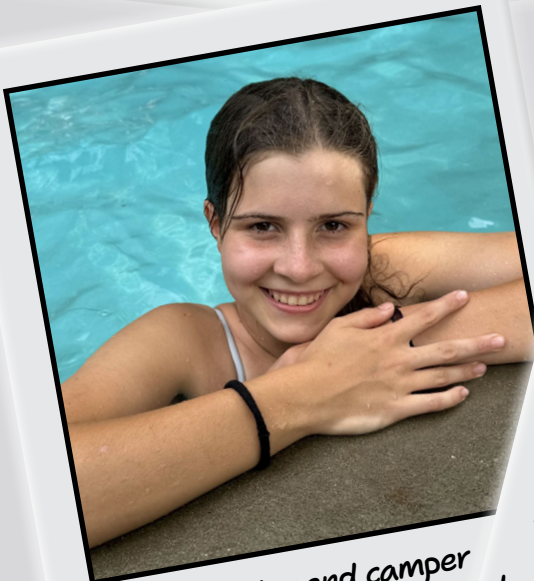
A Senior Legend camper enjoys cooling off in the pool during the Overnight.