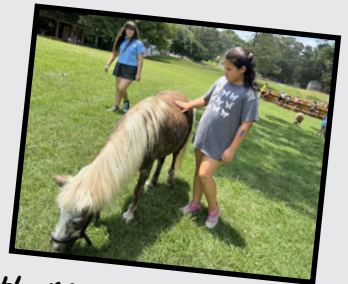
Little Moon gets some love from a Senior Quest camper!