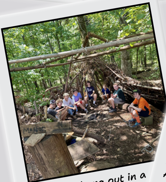
Seniors hang out in a fort in the woods.