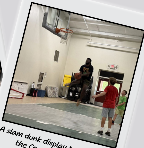
A slam dunk display took place in the Community Center.