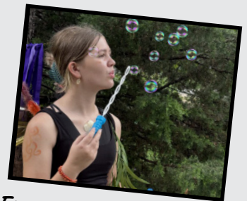
Fun with bubbles on Origin Trail Day!