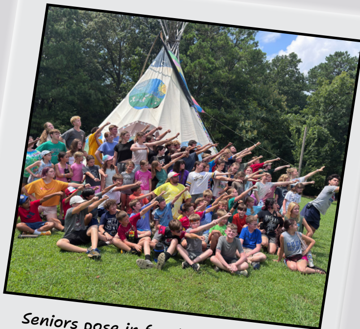
Seniors pose in front of the Tipi!