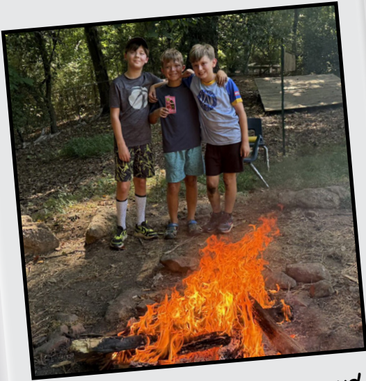
Senior Quest campers are proud of the fire they made!