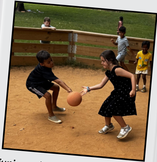
Juniors play an intense game of Gaga Ball!