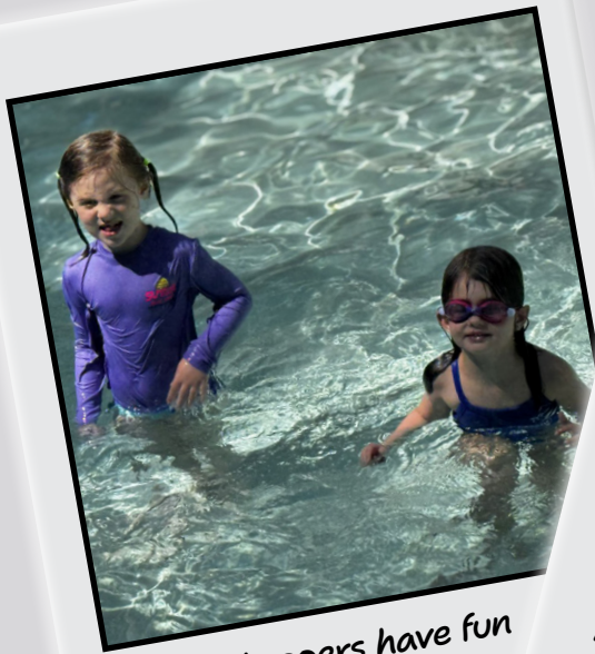
Grasshoppers have fun in the pool.