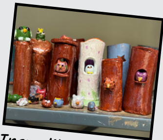
Incredible ceramics projects by Seniors!