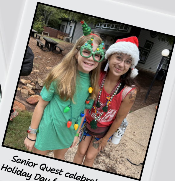
Senior Quest celebrated Holiday Day for Unit Choice.